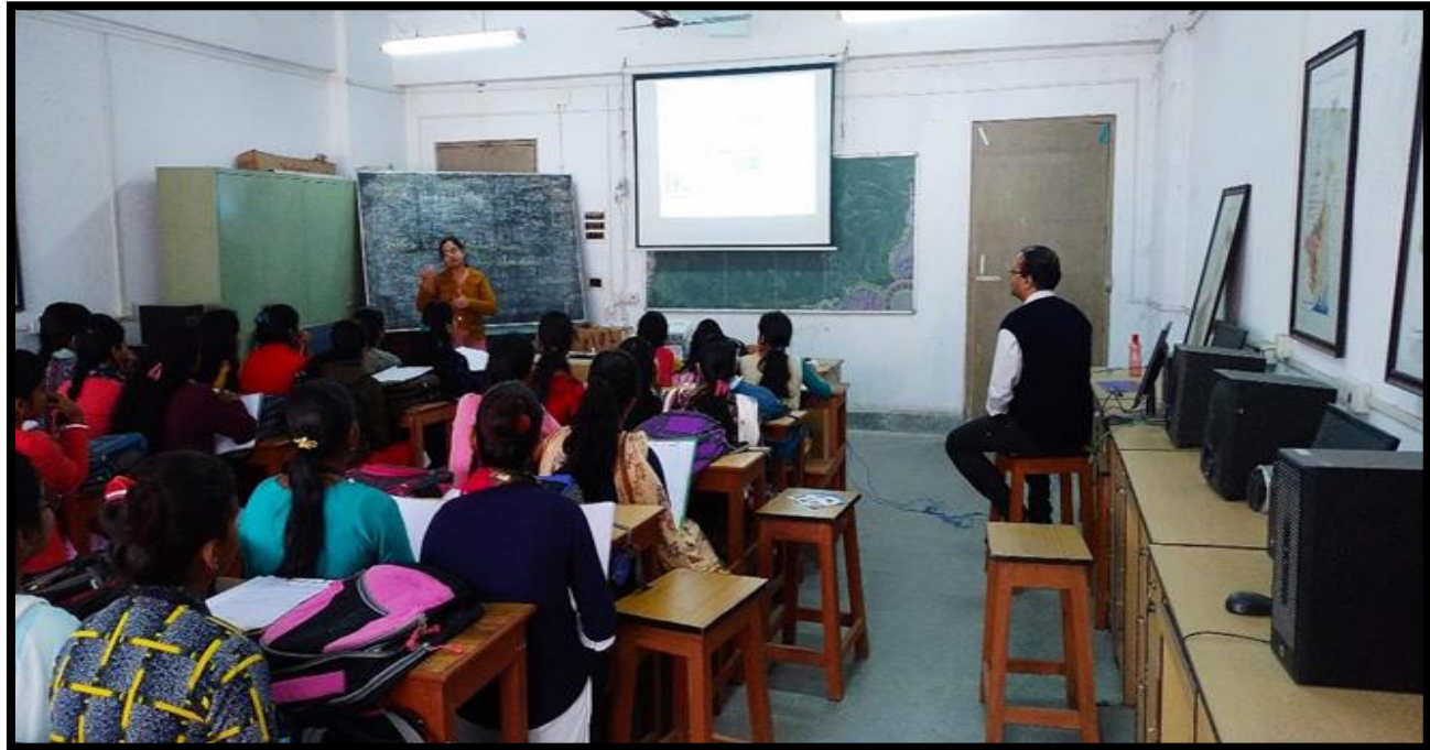
Sample Photograph of the Programme